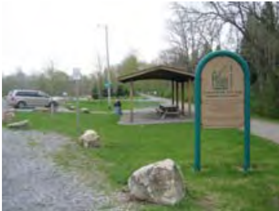
Clarion Little Toby Trail, Jefferson County