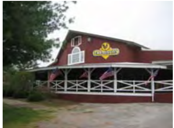
Farmer's Inn, Jefferson County