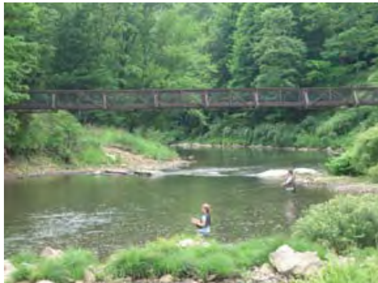
Walter Dick Memorial Park, Jefferson County